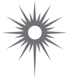
Infrared Sensor Faster Scan Speed