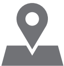
No restrictions Wide Usability